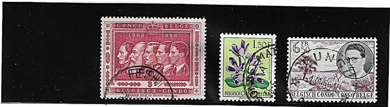
FATUNDU sur WAMBA