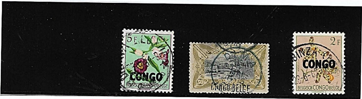
CHUTES FRANCOIS- JOSEPH