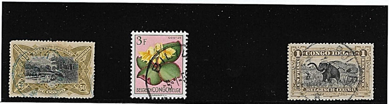
BENA-BENDI (BASONGO DIMA)