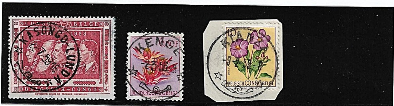
KASONGO - LUNDA