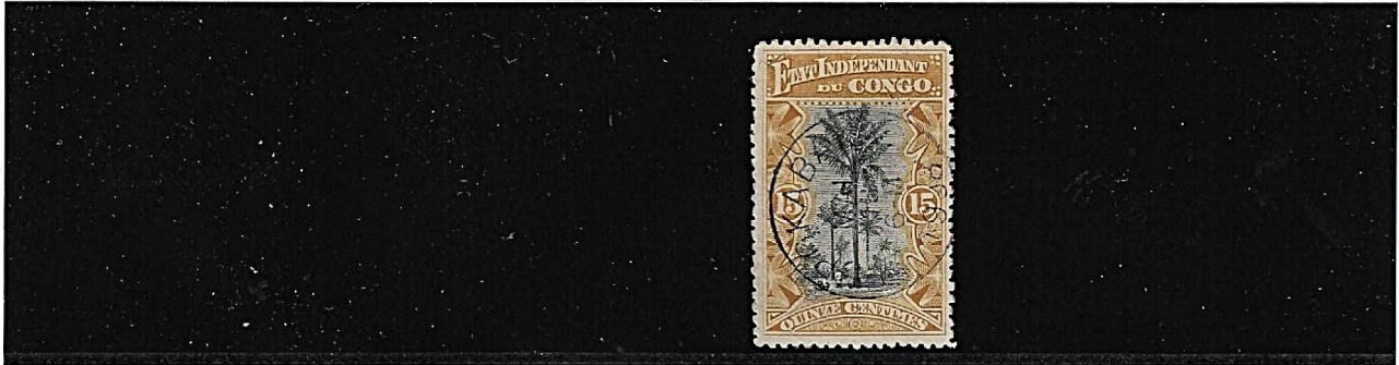
PAY - KONGILA