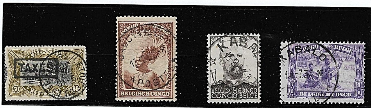
ÉTOILD du CONGO